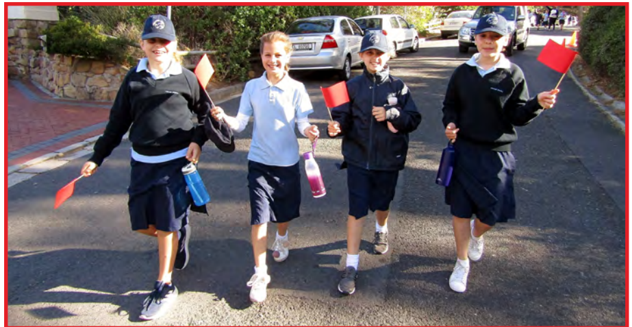
Happy learners from Phyllis Jowell Jewish Day School participating in their mini Blisters for Bread Walk along the Camps Bay Promenade.

Diocesan College on November 27, 2018. The school provided a donation in the amount of R4 751, enabling PSFA to provide ten learners with a daily breakfast and lunch for a year