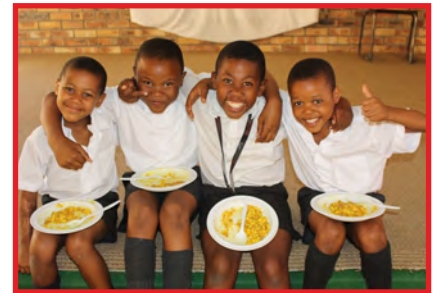
The young lads on our feeding programme at St Paul's Primary enjoying their meals, thanks to a grant provided by The Robben Foundation.