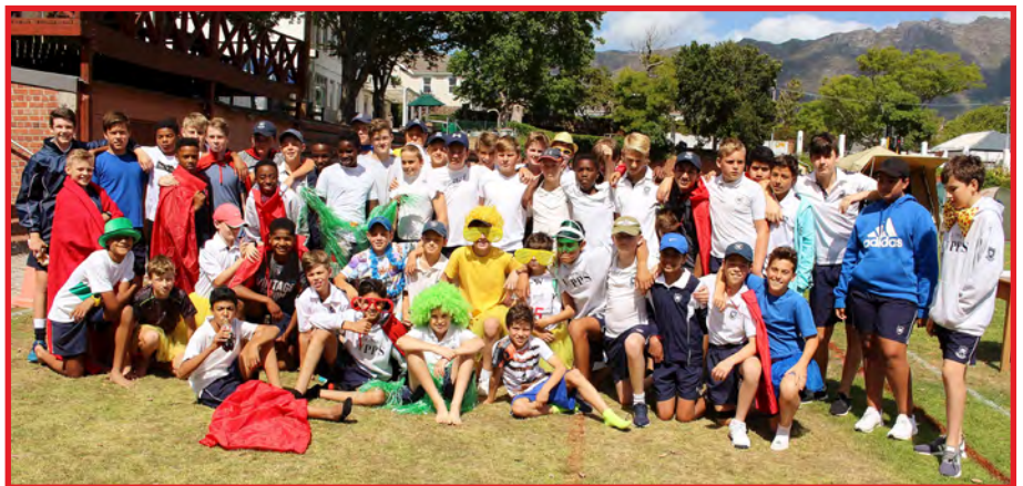
The WPPS Gr. 7's gather for a picture minutes before the start of their 24-hour marathon - #Run4PSFA

PSFA's voluntary general committee, management, staff and in particular the school children on our feeding programme, hereby wish to take this opportunity to thank these schools for their loyal support.