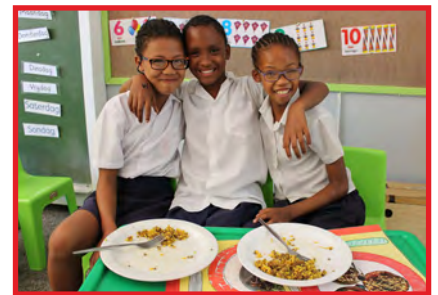
Friends forever - learners at Alta du Toit School socialising during lunchtime.

Ex Director-General of the United Nations' Food and Agriculture Organization