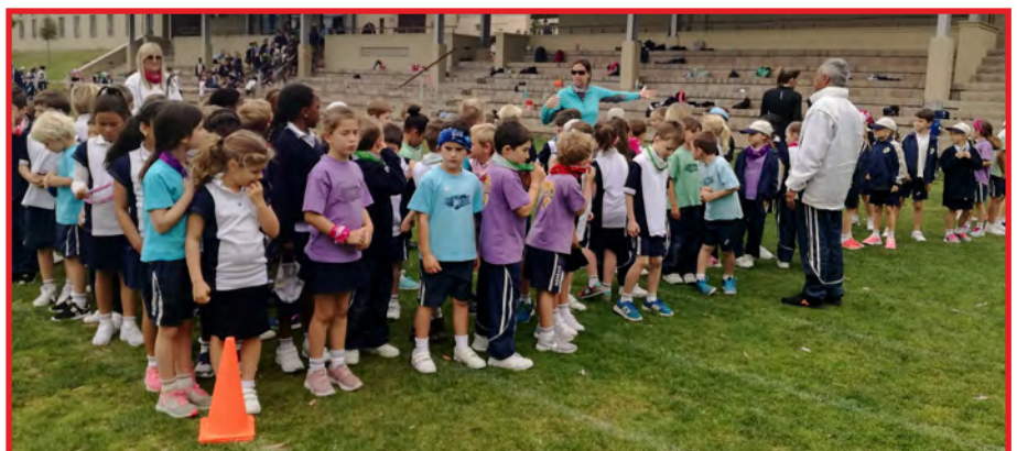
On your marks, get set, go! The excited learners at Reddam House Prep at the start of their mini Blisters for Bread walk.