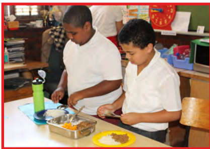
Learners with Autism at Alpha School dishing up their own lunches. PSFA's feeding programme at this school forms part of the learners' educational curriculum.